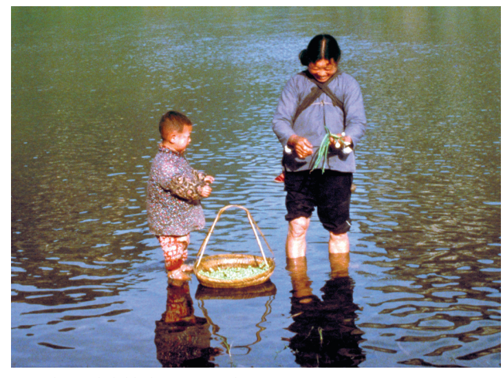
A mother and child plant rice in China.

Food has special significance in Chinese culture. Focus is often placed on texture, flavor, color, and aroma (K. Lin, 2000). Though diet varies by region, vegetables are an important part of the diet in every region. In the North, the main staples are wheat, corn, millet, and fresh vegetables. When fresh vegetables are unavailable, preserved cabbage, potatoes, and radishes are substituted. In the South, rice and sweet potatoes are staples, and fresh vegetables are usually available year round (X. Liu, 2004).