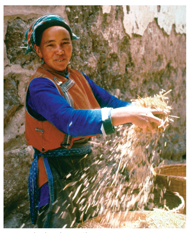
A woman threshes wheat in China.

In China, care seeking often involves choosing from many resources. Because the People's Republic of China awards Chinese and Western medicine the same status, people may use either treatment practice or a combination of both (X. Liu, 2004). Although traditional practitioners focus primarily on Chinese medicine during formal schooling, they also receive basic training in Western medicine. Thus, traditional practitioners can treat and cure patients using methods from both systems (X. Liu, 2004).