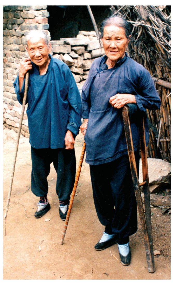
Two elderly women wear three-inch lotus shoes in rural China. The ancient custom of foot binding, banned in 1911, has caused severe disabilities for many elderly women, even in today's China.