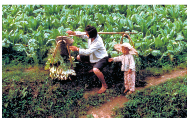
A woman with her child tends farm in China.

Traditional Chinese medicine classifies TB as a disease caused by a deficiency in the lungs of qi and yin , and by an invasion of evil ( xie ) comparable to the concept of bacterial infection in biomedical terms (Ho, 2006). Traditional practitioners may describe TB as feibing , fei jie he , or feilao , terms that relate to lung disease. Though no equivalent biomedical term for TB exists in traditional Chinese medicine, fei jie he is generally used for an infectious lung disease that requires isolation (Ho, 2006). To treat TB, traditional practitioners may suggest Western antibiotics in conjunction with traditional