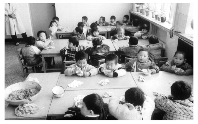
Children at a day care center near Beijing.

In Chinese culture, education is valued highly and considered essential for success. Children who do poorly in school are viewed as bringing shame upon their families (Chin, 2005). In mainland China, 90.9% of the population is literate (defined as the ability to read and write and aged 15 years or older). Literacy rates are approximately 10% higher for males than females (95.1 and 86.5, respectively) (Central Intelligence Agency, 2005).