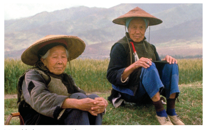
Two elderly women in China.

The Han, commonly called Chinese in English, are known as Han-ren in China and Taiwan (X. Liu, 2004). The